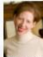
Beatty Seimppson Chapman The King Hides His Daughters