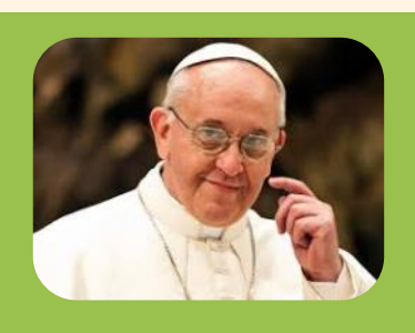
Pope Francis says:

Please call to confirm your attendance 215-587-3540